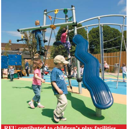
RFU contibuted to children's play facilities

The Rugby Football Union will be supporting Richmond upon Thames Council and the Twickenham Riverside Trust, to ensure that the new gardens will become a focus for the community's use of the riverside.