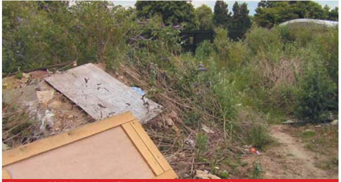
January 2012 Derelict - Closed to the public for 32 years

For latest information: www.twickenhamalive.com and www.richmond.gov.uk/twickenham riverside