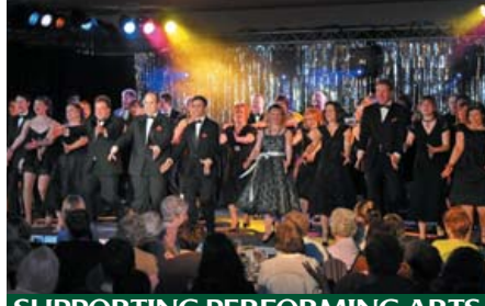
SUPPORTING PERFORMING ARTS IN OUR LOCAL COMMUNITY